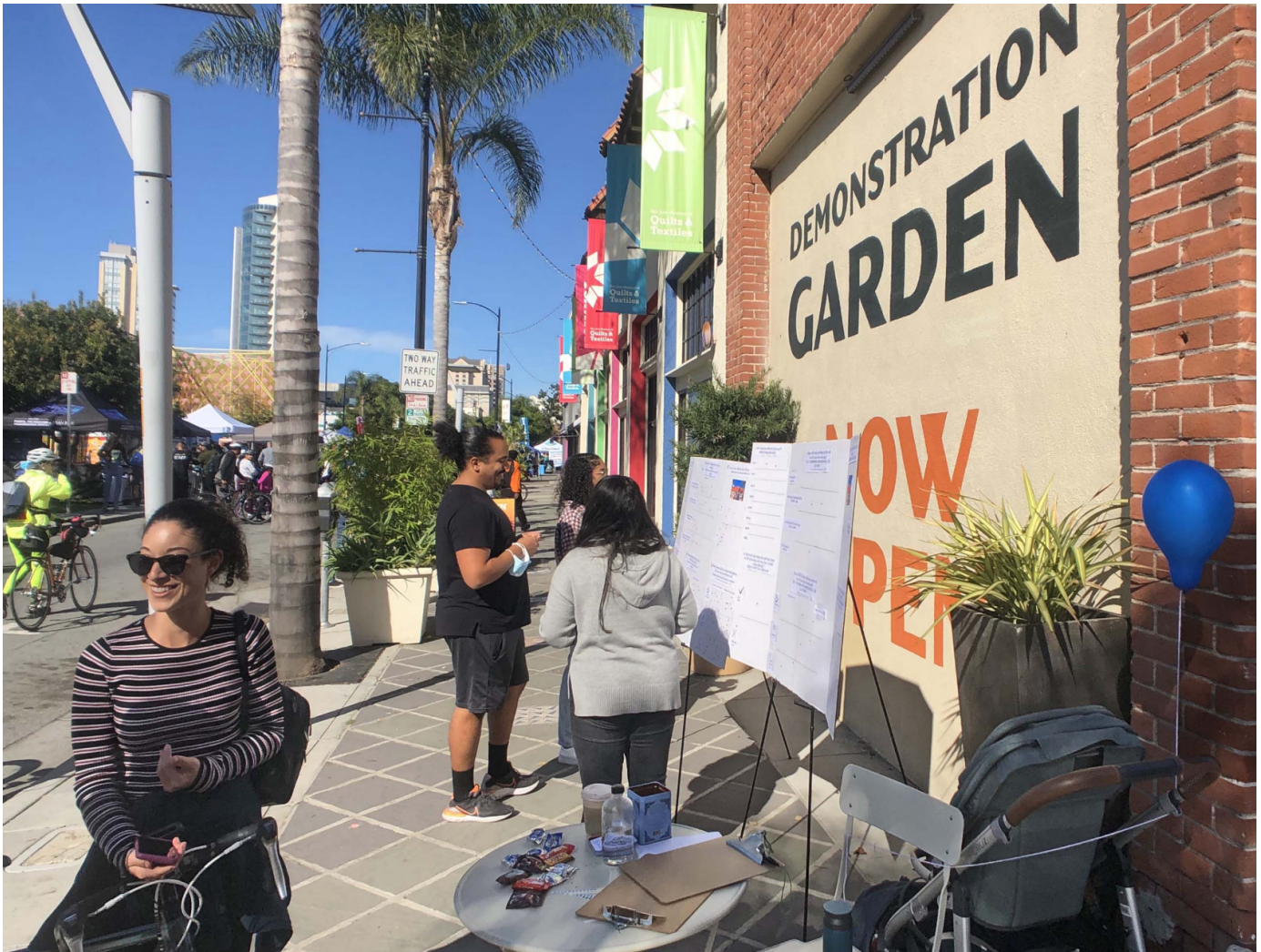
Figure 2. Students engage with participants at the SoFA Pocket Park entrance during San José’s popular Viva CalleSJ event.