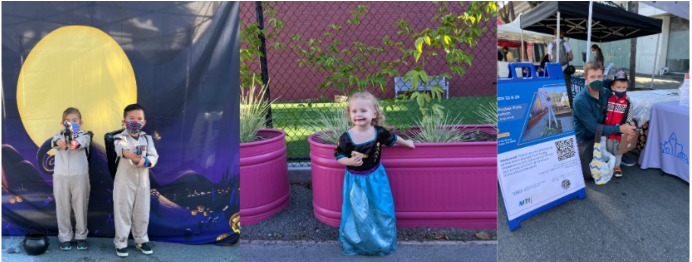
Figure 7. Images of K-12 community members participating in the SoFA Pocket Park Exploration and SoFA Farmer’s Market.

While moving through each of the activity stations, the SJSU graduate students and Veggielution volunteers engaged in conversation with the youth, inquiring as to their participation in the park activities as well as encouraging discussion of university life. A total of 25-30 youth ranging in ages from 2-15 participated in the SoFA Pocket Park Exploration events.