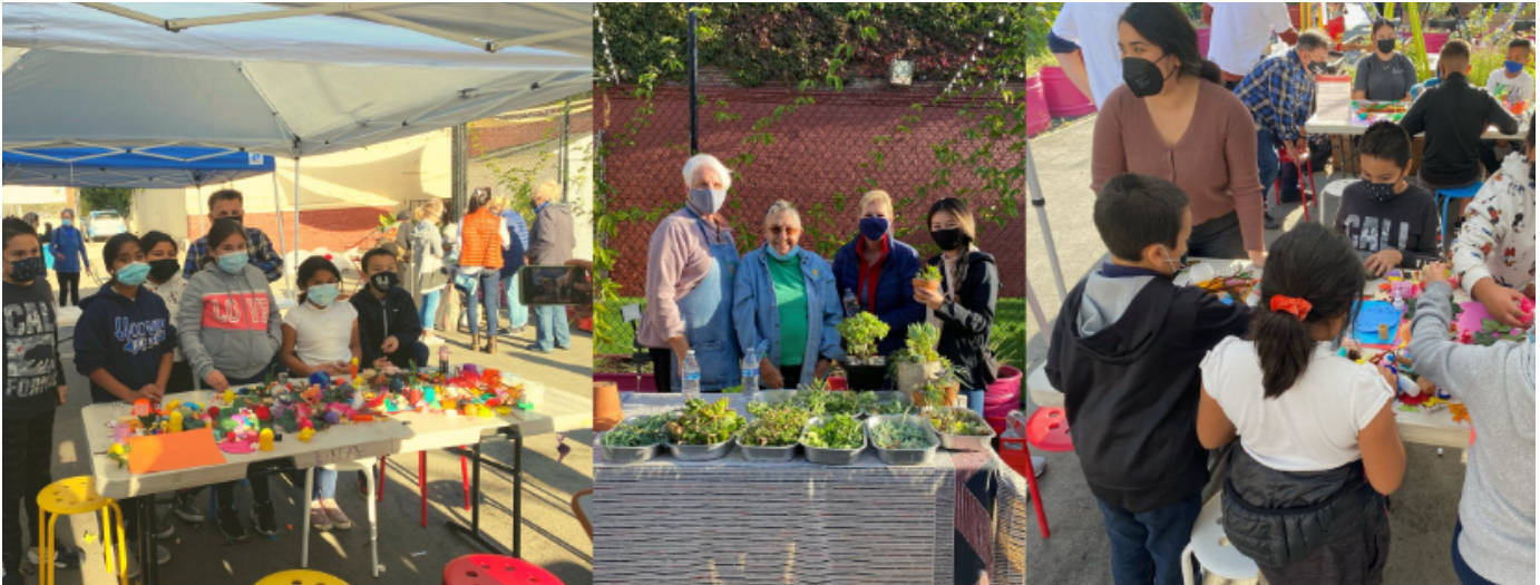
Figure 5. Images of community members participating in the SoFA Pocket Park Exploration

The second event capitalized on the Halloween holiday and encouraged visitors to wear their Halloween costumes to the SoFA Pocket Park Exploration. Activities included: